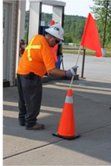
Place flags in cones