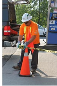
Isolate work area with caution tape