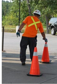
Place cones around work area